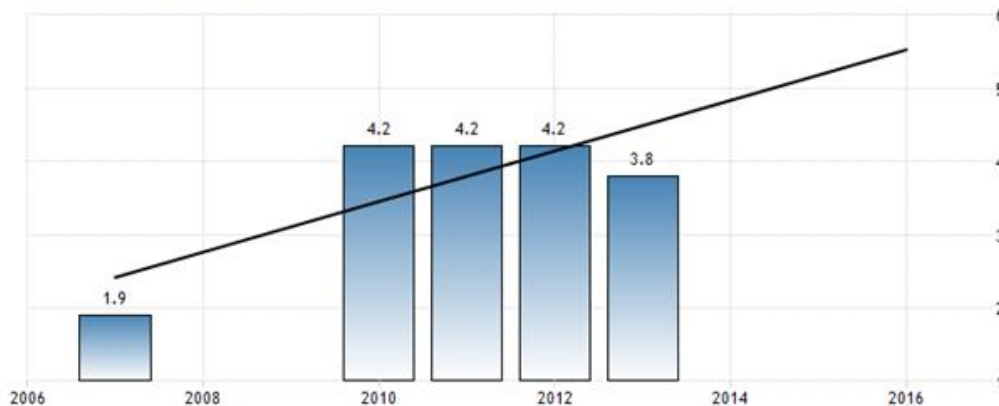
UGANDA UNEMPLOYMENT RATE

The provisions regulating employer-employee relationships are laid out in the Employment Act., which is the binding law in Uganda.